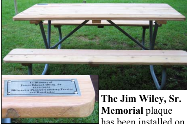
The Jim Wiley, Sr. Memorial plaque has been installed on

the newly refurbished, cedar picnic table.